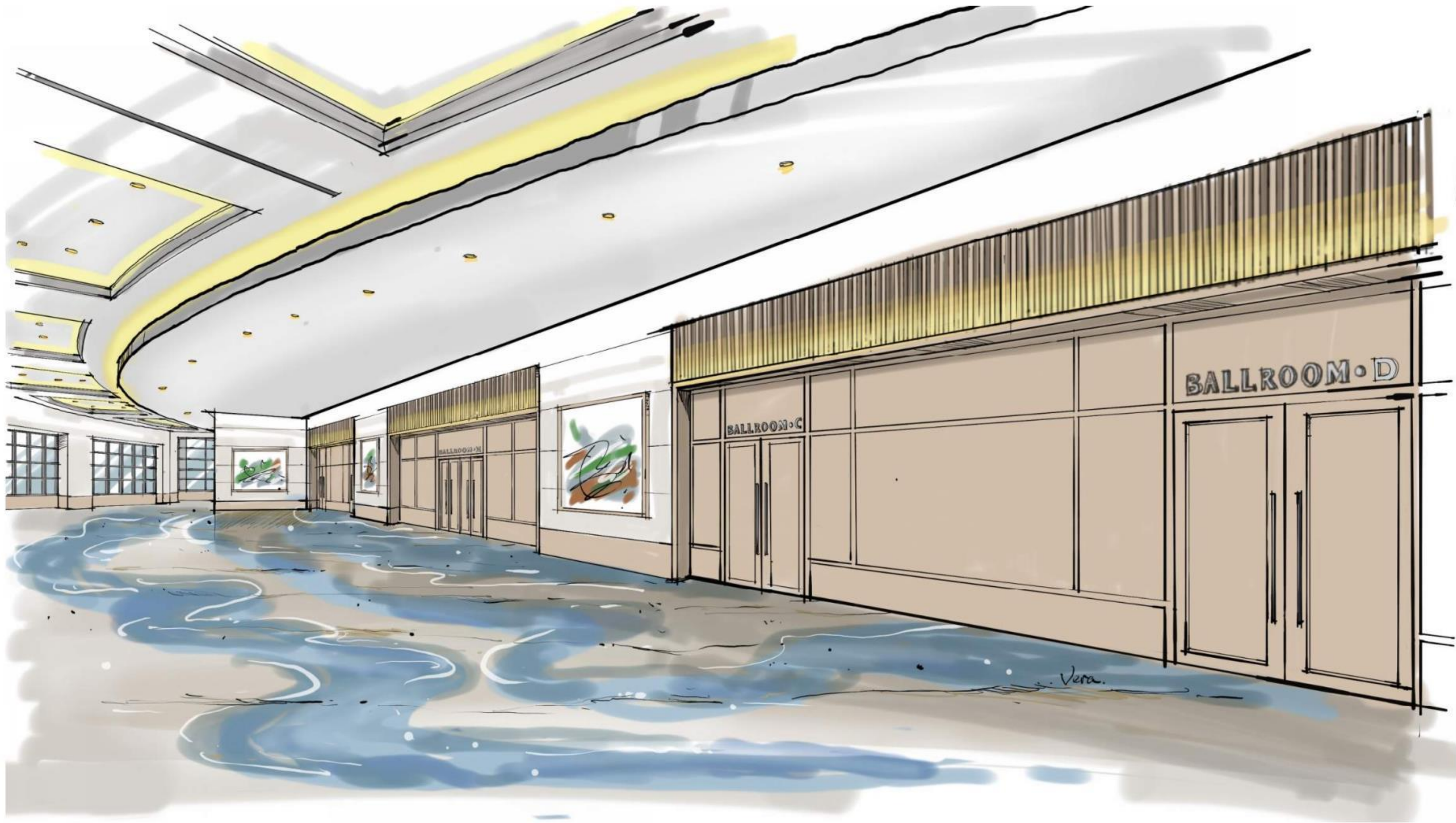
BALLROOM PRE-FUNCTION RENDERING